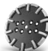
BG718250BLACK-P+ Premium+ Disc Ø250 mm