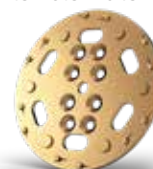
BG707250-1 PCD Disc Ø250 mm