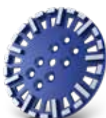
BGE718250BL Euro Disc Ø250 mm