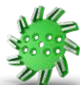
BG707117 Star Disc Ø250 mm