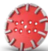
BG718250RD-P+ Premium+ Disc Ø250 mm