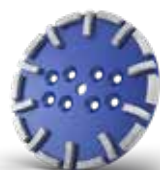
BG718250BL-P+ Premium+ Disc Ø250 mm