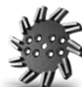
BG707114-1/BLACK Star Disc Ø250 mm