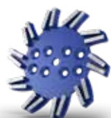
BG707116 Star Disc Ø250 mm