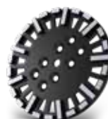
BGE718250BLACK Euro Disc Ø250 mm