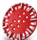
BGE718250RD Euro Disc Ø250 mm