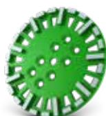
BGE718250GR Euro Disc Ø250 mm