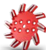
BG707118 Star Disc Ø250 mm